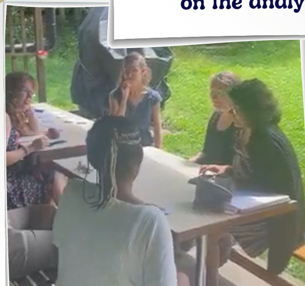
Play Time's up to review the 300 drugs