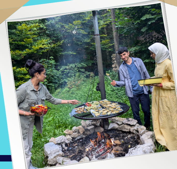
BBQ time !