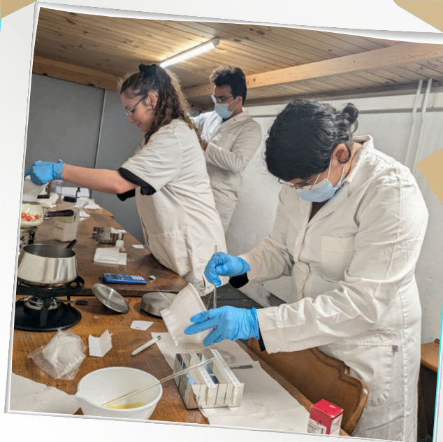
Galenics workshop: suppository casting