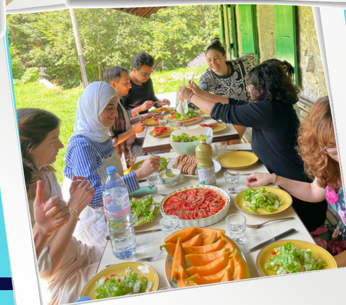
Home-made lunch in the sunshine