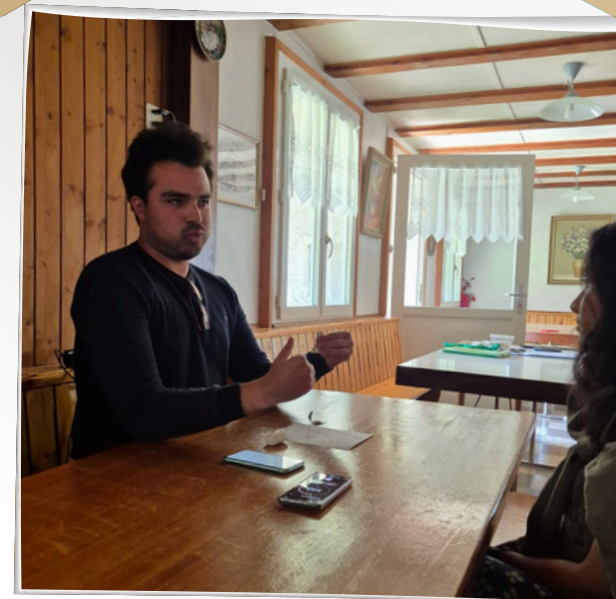
OSCE training: inhalation devices