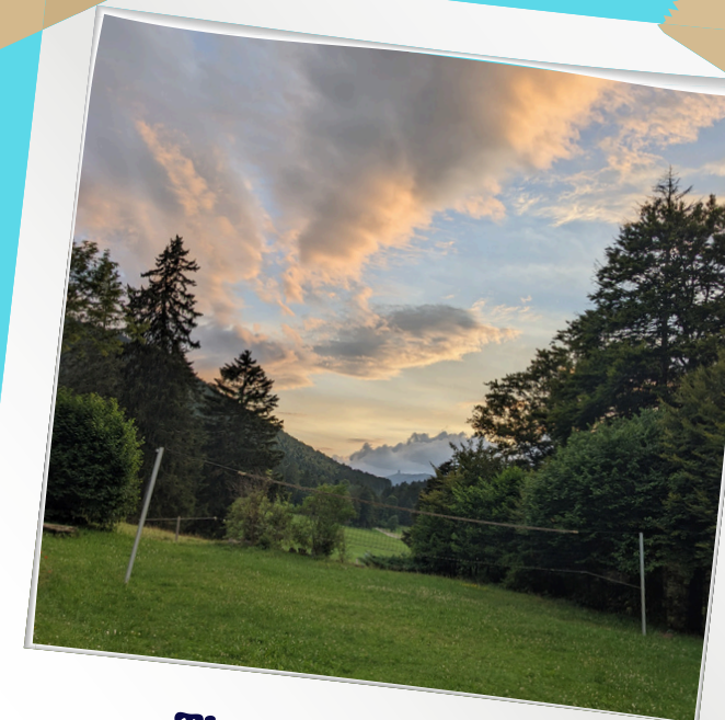
The view from the chalet...