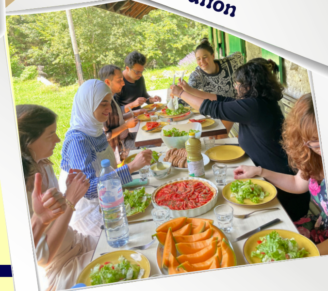
Home-made lunch in the sunshine