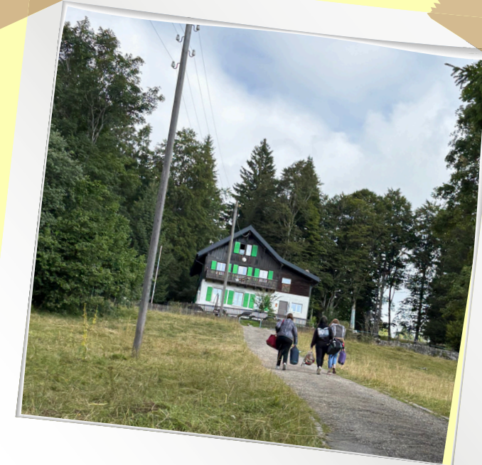
The view of the chalet...