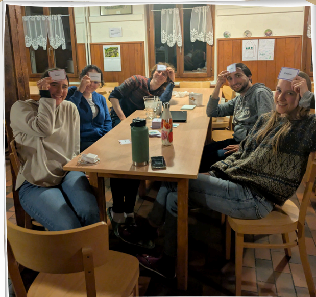
Play The Amnesiac to review the 300 drugs