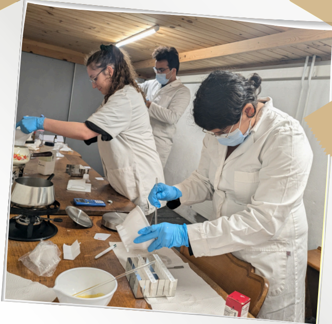
Galenics workshop: suppository casting