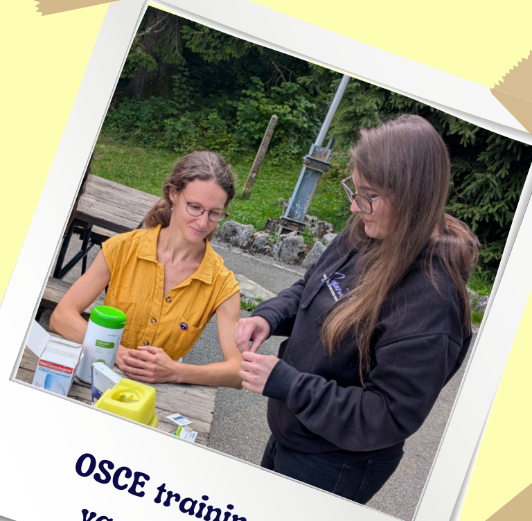
OSCE training: vaccination