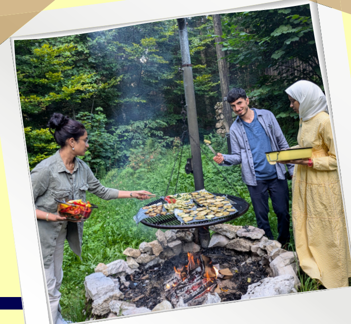
BBQ time !